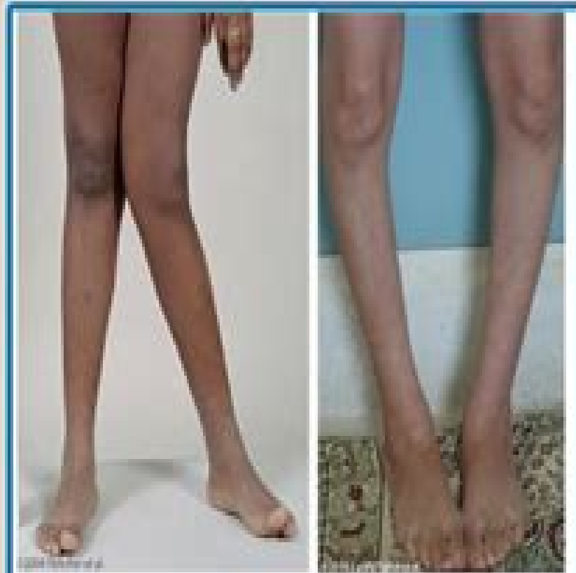
Genu Valgum "Knock-Knee"